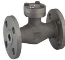
Piston Check Valve