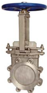
Knife Gate Valve