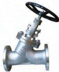
'Y' Pattern Valve