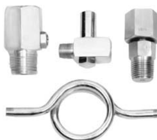
Pressure Gauge Accessory