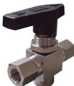
3 Way Ball Valve