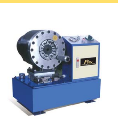
Hose Crimping Machine