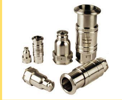
Dry Break Couplings