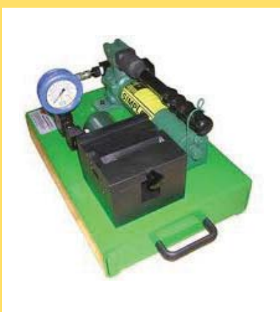
Tube Flaring Machine