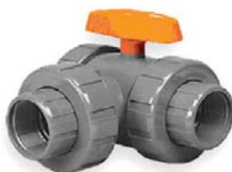
PVC, CPVC & UPVC Valve