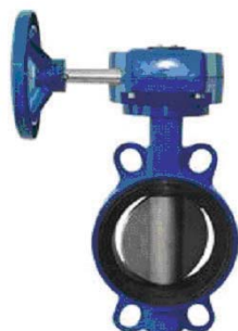
Wafer Type Butterfly Valve