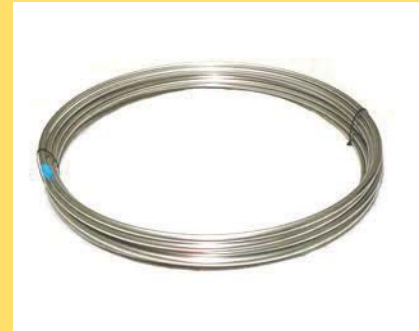
SS Coil Tubes