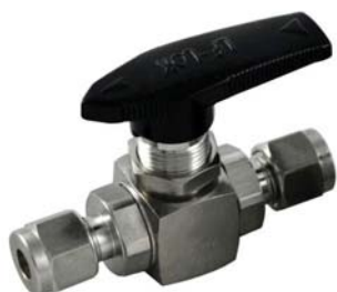
2 Way Ball Valve