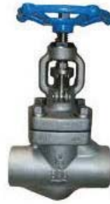
Threaded/SW Gate Valve