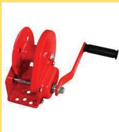
Manual Lever Winch