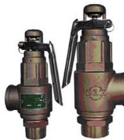
Safety Relief Valves