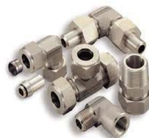
Bite Type Fittings