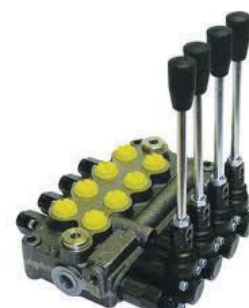
Directional Control Valve