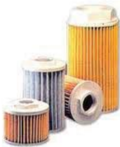
Oil & Air Filter Elements