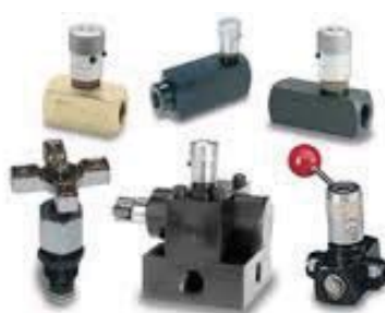
Flow Control Valves