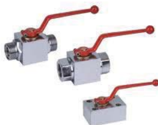
HP Ball Valves