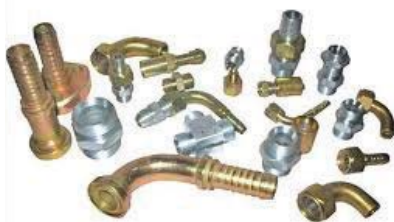
Hydraulic Hose Fittings