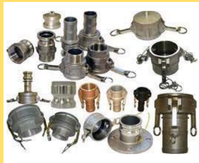
Cam & Groove Coupling