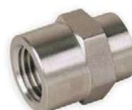
Red. Female Coupling