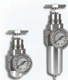
Stainless Steel Filter Regulator