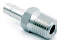
Tube Male Adaptor