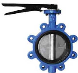
Lug Type Butterfly Valve