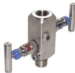
Multi Port Valve