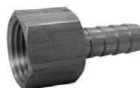
Female Hose Nipple