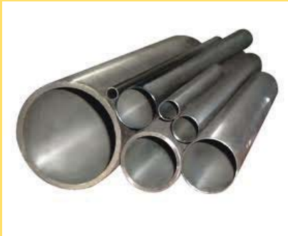
SS/CS Pipes & Tubes