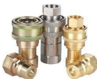
Hydraulic Quick Coupler