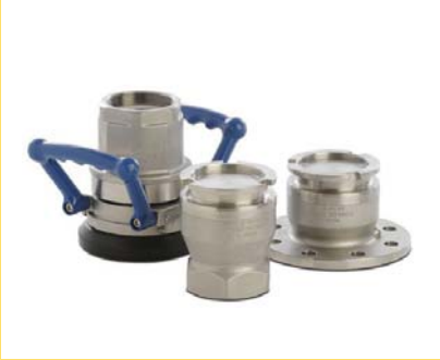
Dry Disconnect Coupling