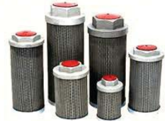
Fuel Filter Elements