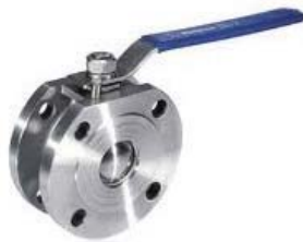
Wafer Ball Valve