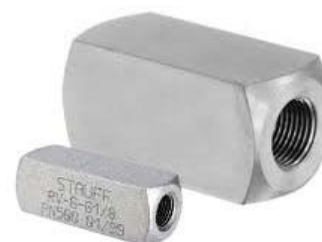
High Pressure Check Valves