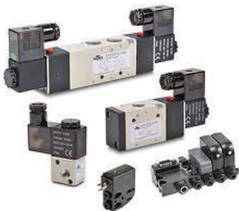
Pneumatic Solenoid Valves