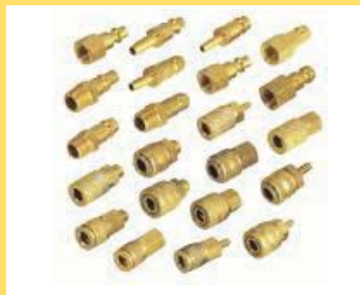
Brass Quick Coupler