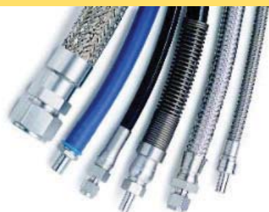
PTFE SS Hoses