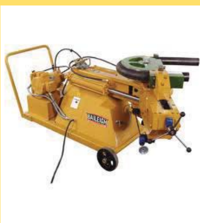
Tube & Pipe Bender