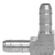
Hose Barb Elbow