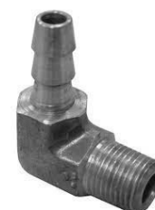
Elbow Male Hose Barb