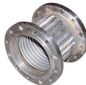
Stainless Steel Hoses