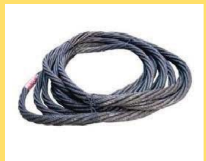
Marine Steel Wire Rope