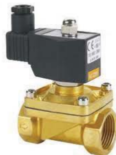
WOG Solenoid Valve