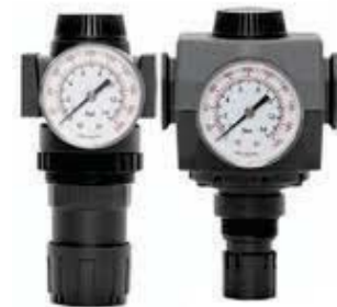
Filter & Regulator