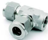
Female Run Tee