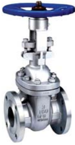
Flanged Gate Valve