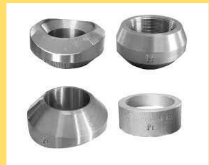
SS/CS Weldolet & Sockolet