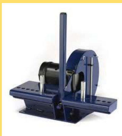
Hose Cutting Machine