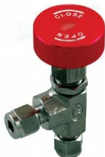
Angle Needle Valve