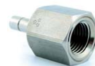
Tube Female Adaptor