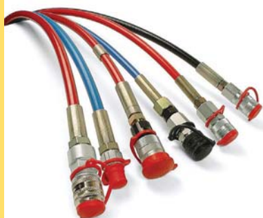
High Pressure Thermoplastic Hoses