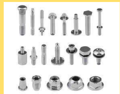
Stud Bolts & Nuts