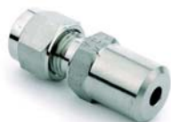
Socket Weld Connector