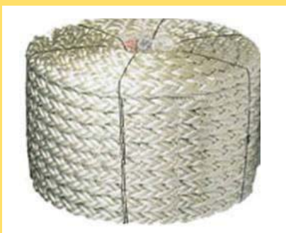
Marine Nylon Rope