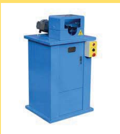
Hose Skiving Machine