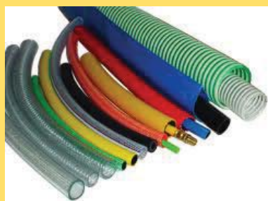
Water & Air Hoses