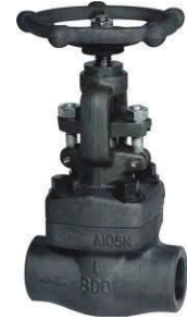
Threaded/SW Globe Valve