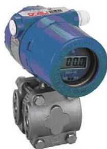
Digital Flow Meter