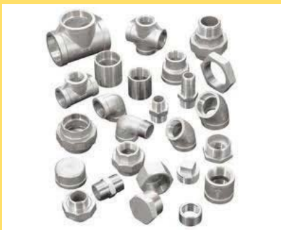
SS/CS Threaded Fittings