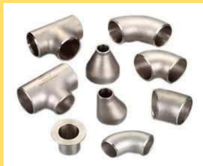
SS/CS Welded Fittings