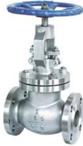
Flanged Globe Valve