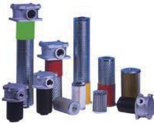
Hydraulic Depot Filters