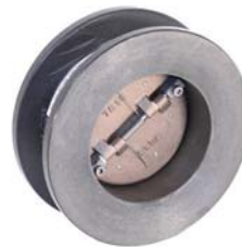
Wafer Check Valve