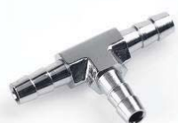
Hose Barb Tee