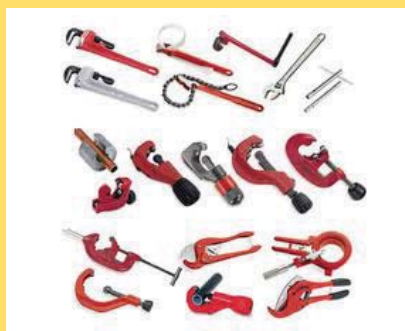
Wrenches & Tube Cutters