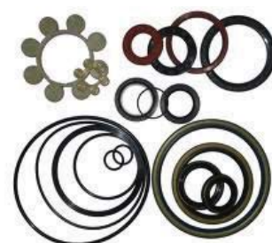
O-ring & Seals