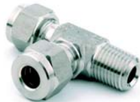
Male Run Tee