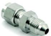
Male Thermo Connector