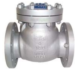
Swing Check Valve