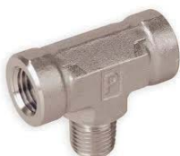
Male Branch Tee